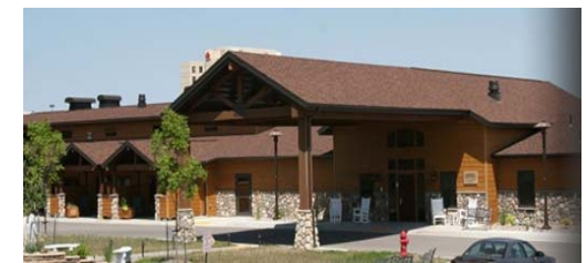
RCRH Home Care & Hospice, Rapid City, SD