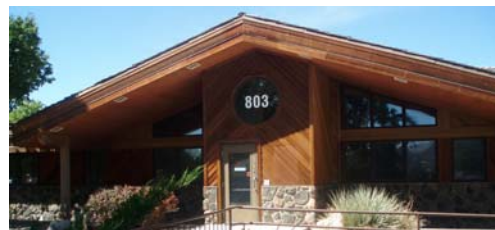
Community Transitions, Rapid City, SD